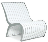
Lounge Chair TD 2100