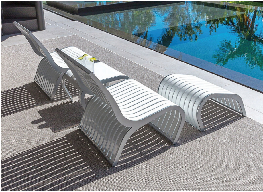
Above: Tides Lounge Chair, Ottoman, and Coffee Low Side Table in Gloss White and Silken Silver; Top Right: Tides Lounge Chair in Matte Black and Desert