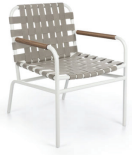
Dining Arm Chair MN 2030D