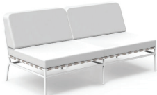
Double Center Section MN 2170L