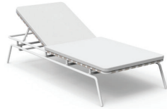
Chaise Lounge MN 2890L