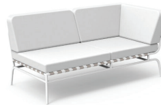
Left Arm Section MN 2140LL