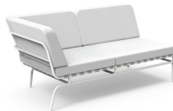
Right Arm Section MN 2150LR