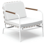
Lounge Chair MN 2100LD