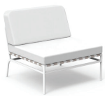
Center Section MN 2160L