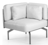
Corner Section SL 2170L