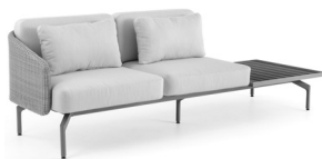
2 Seat with Left Side Table SL 2130LLT