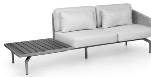
2 Seat with Right Side Table SL 2130LRT