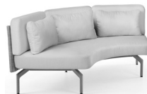
Curved Section SL 2190L