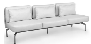
3 Seat Sofa Center Section SL 2130LC