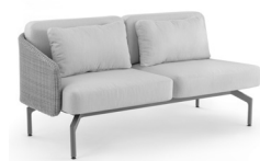
2 Seat Left Arm Section SL 2140LL